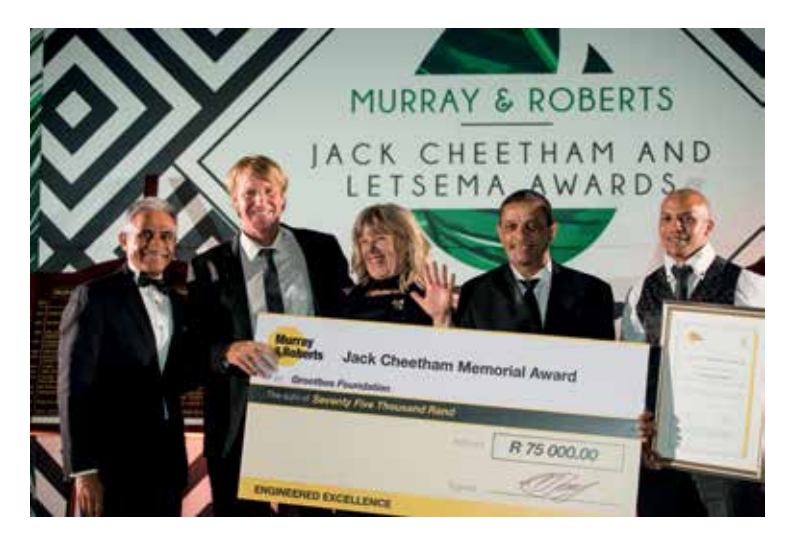
GROOTBOS FOUNDATION – ROCK THE BOAT CANOEING PROGRAMME Rock the Boat Canoeing Programme was established in 2016 by the Stanford Canoe Club, part of the Grootbos Foundation, as a development programme to attract youngsters from the local communities in the rural Overberg region in the Western Cape to the sport of canoeing.

Over the past five years the club has produced 149 gold medals, 10 silver and bronze medals at the South African National Championships. In 2004, the club caused an upset at the World Acro Gymnastics Age Group Games, by beating the Russian favourites to win the gold medal in their age group category. They are consistently amongst the top performers in international competition, despite their humble beginnings and lack of funding.